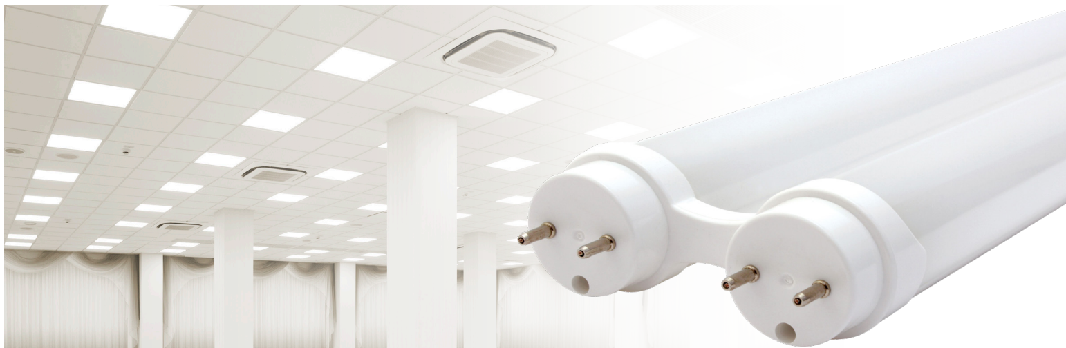
Application illustration only, subject lamps not used in photo.