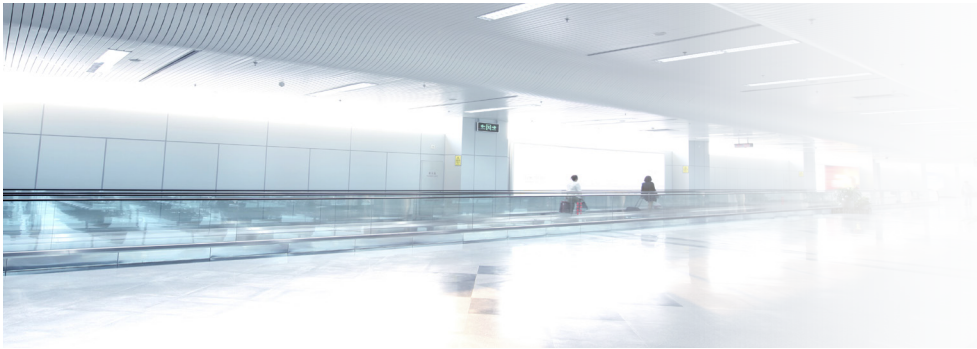
Application illustration only, subject lamps not used in photo.