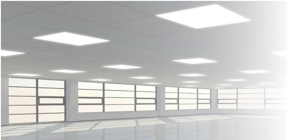
Application illustration only, subject lamps not used in photo.