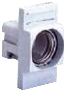
D-Type Fuse Bases, Screw-in