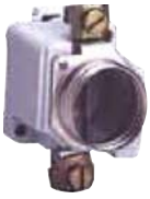
D-Type Fuse Bases, Snap-on, 500VAC/VDC

Mersen D-type fuses are 500 Volts AC/DC rated with 75kA interrupting rating. They have 5 physical sizes (NDZ, DII, DIII, DIV, and DV) and fit into special screw caps. All fuses have blown-fuse indicators which are visible through the screw cap. Screw caps fit onto single pole bases which are screw or DIN rail mounted. All accessories such as covers, adapter rings, and gauge rings are described.